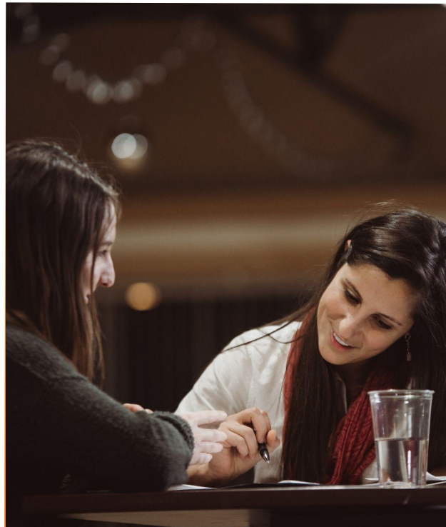
Life and Career Coaching