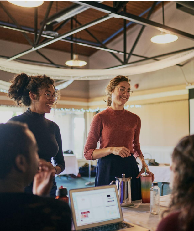
Job, life and leadership skills workshops